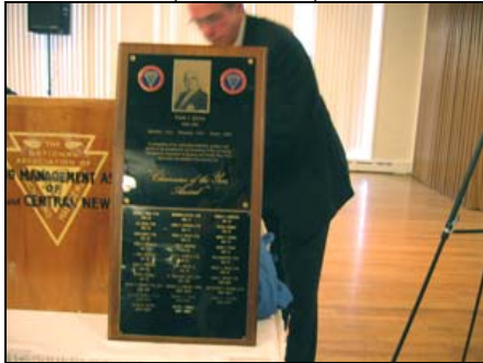
Frank J Quinn Award