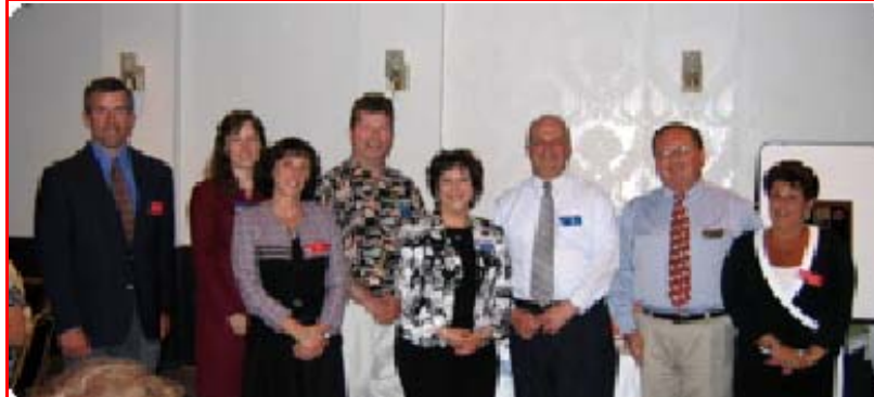
2005 - 2006 Board Members